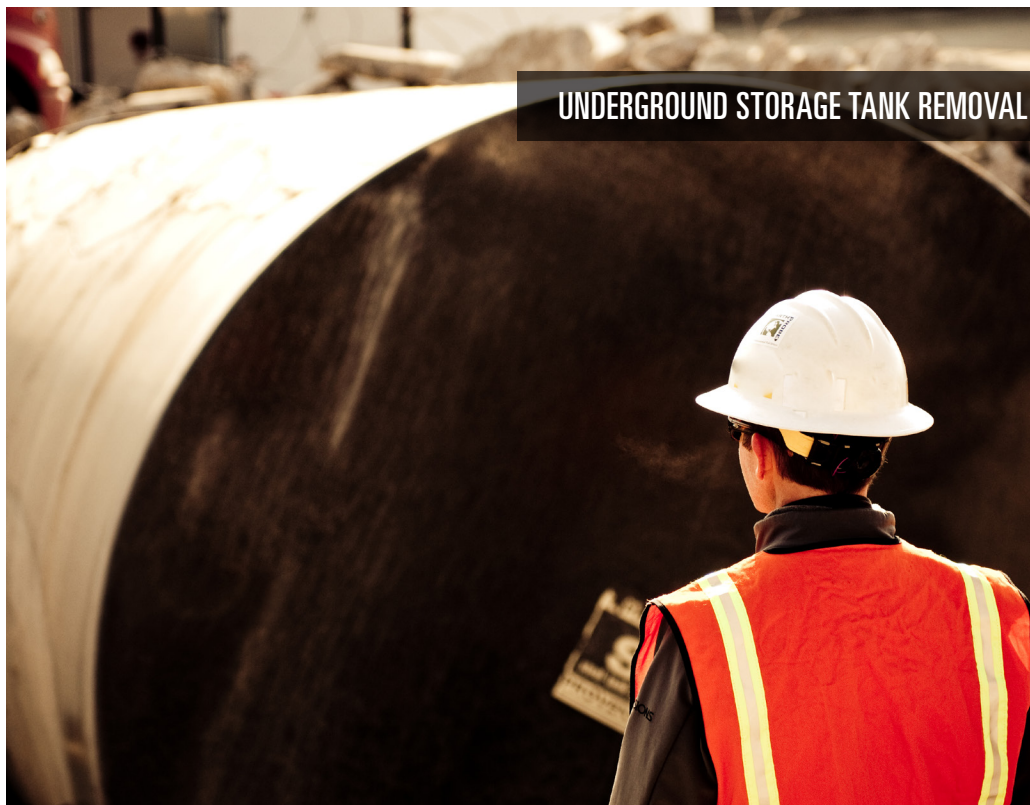
UNDERGROUND STORAGE TANK REMOVAL

We have extensive expertise in a broad range of sectors, including: oil and gas exploration/production, commercial-retail, energy, solid waste, industrial, federal, and Brownfields.