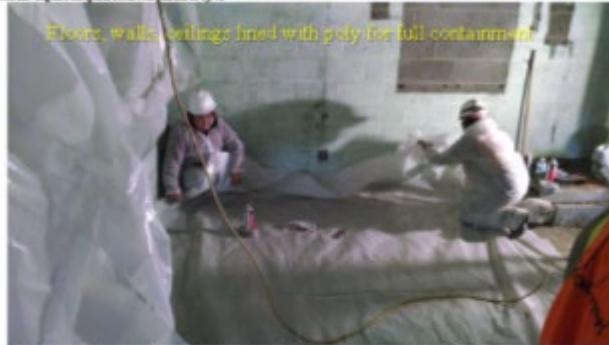
Floor, walls, ceilings lined with poly for full containment