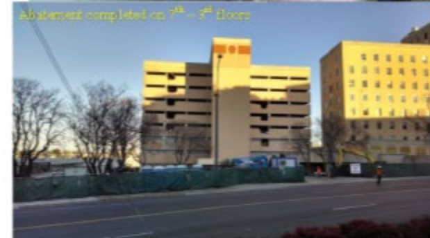
Abatement completed on 7 th – 5 th floors