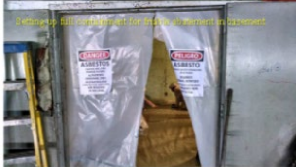
Setting up full containment for friable abatement in basement

Week of February 25, 2014 Knoxville Baptist Hospital Redevelopment Project