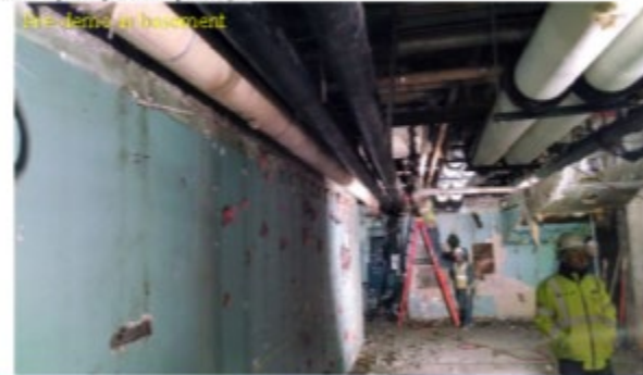
Air clearance in basement